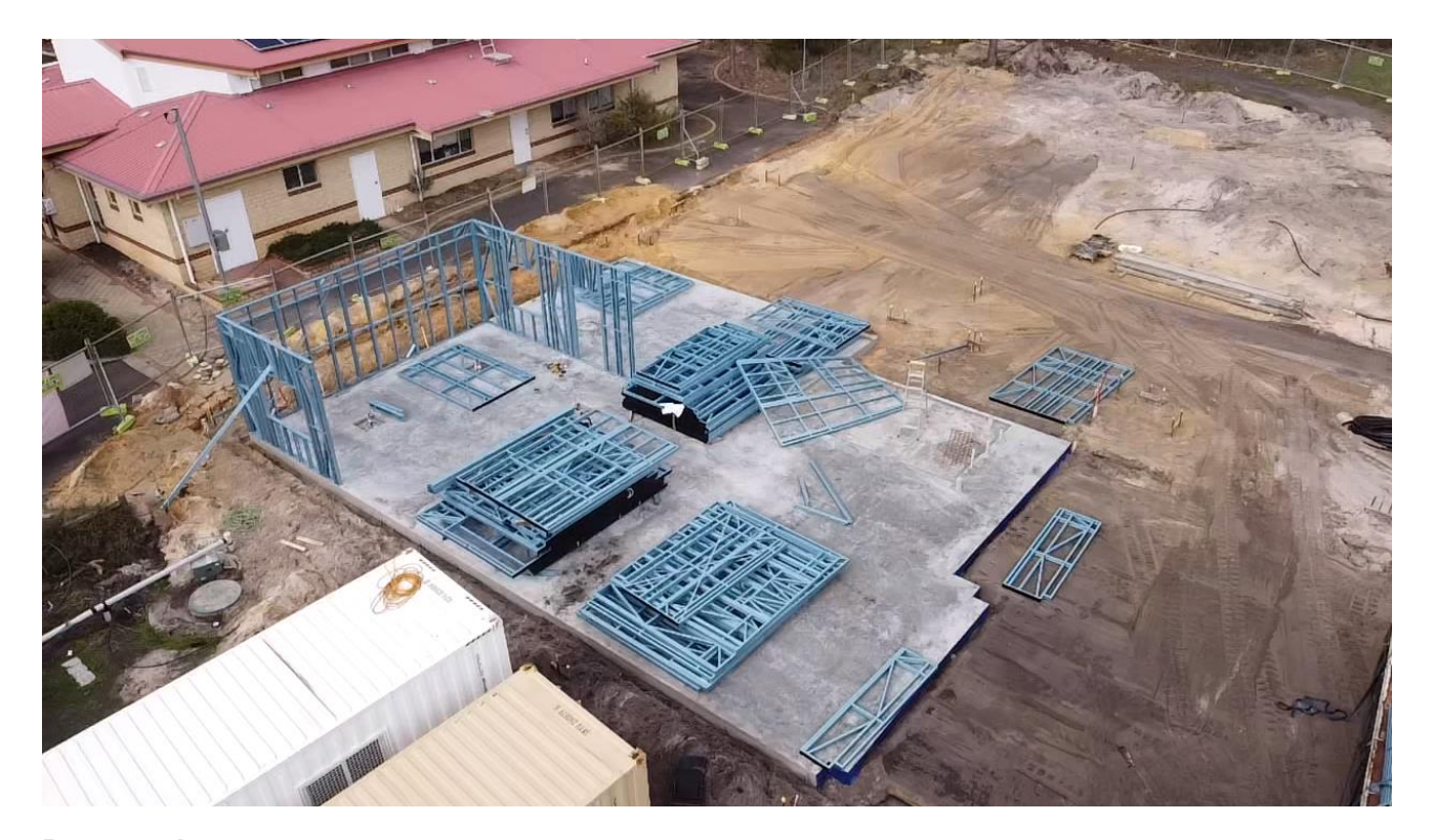
Progress Images: (Images taken 3 July 2023)