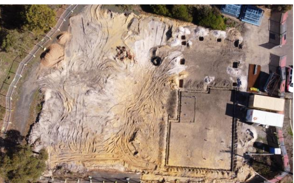
Progress Images: (Images taken 2 June 2023)